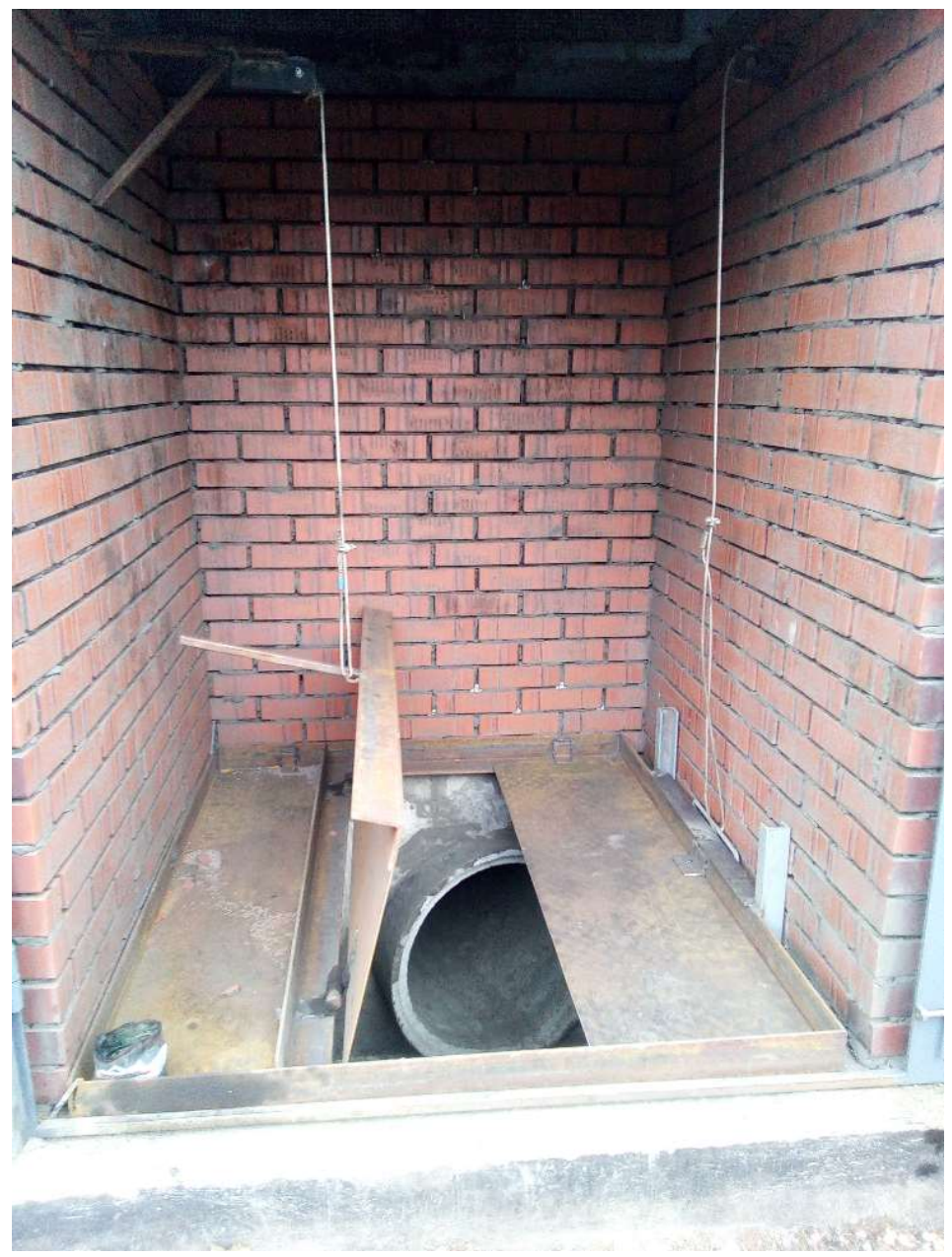
Fig. 5. The opening W(2015) – the regulation window - view inside