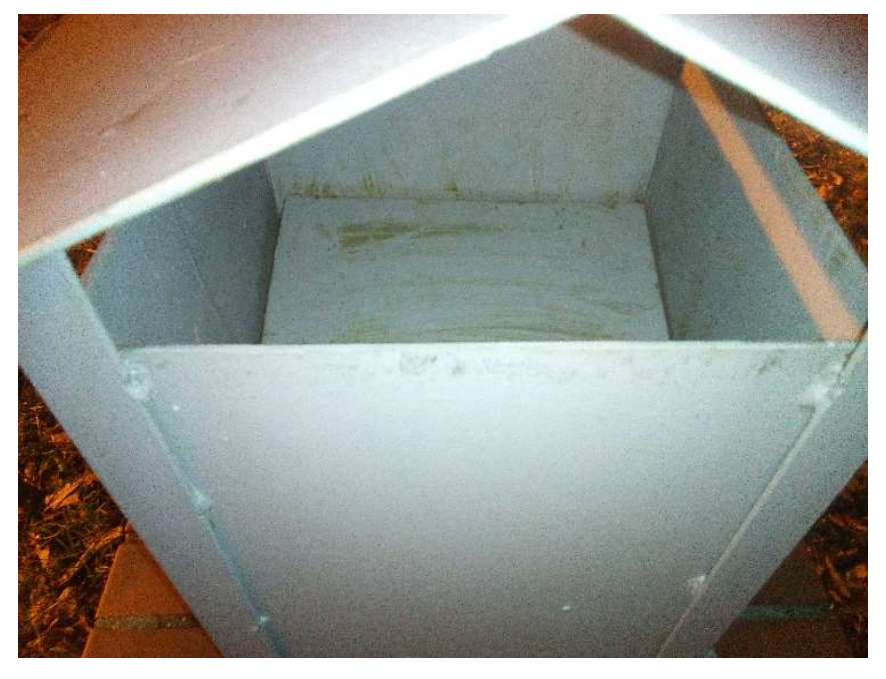
Fig. 3. The skylight No. 3 – the regulation window (author's photo)