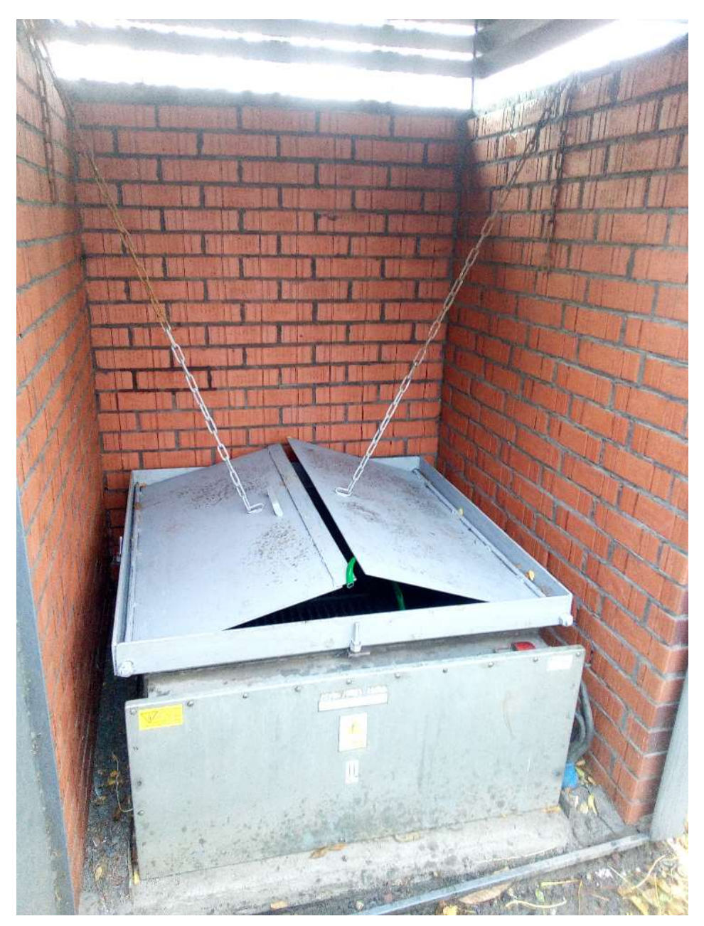
Fig. 4. The opening W(2015a) – the regulation window