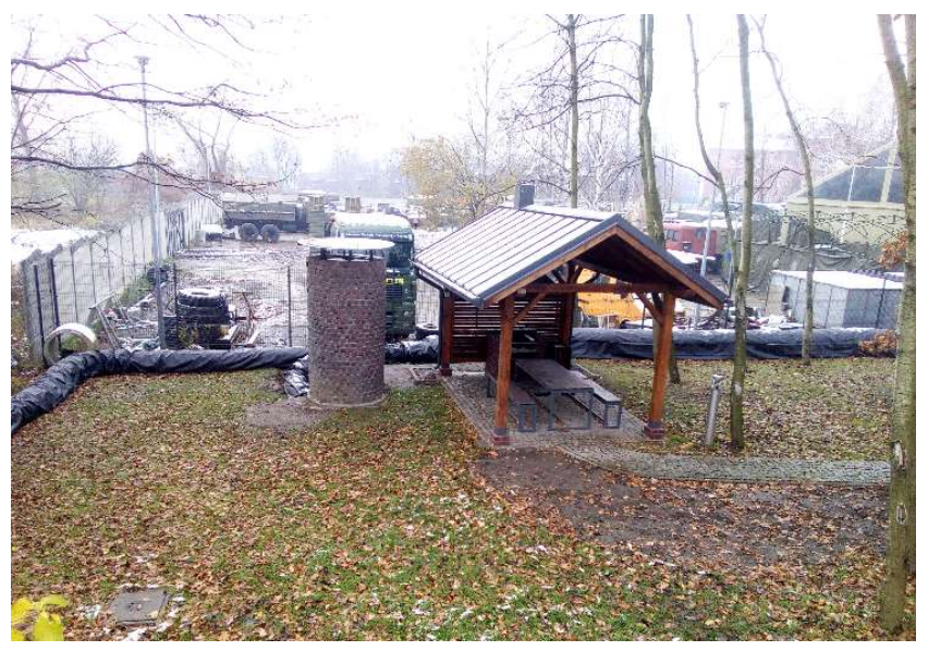
Fig. 8. The air duct installed at the surface for connecting the opening W(2015) with the opening W(2016) and W(2015a) - the recuperation – the opening W(2016)