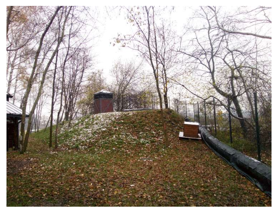
Fig. 9. The air duct installed at the surface for the recuperation - the opening W(2015a)