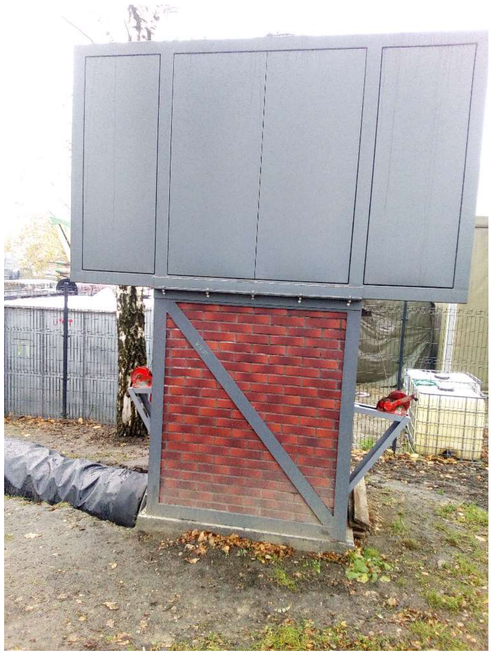
Fig. 6. The opening W(2015) – the regulation window – outside view