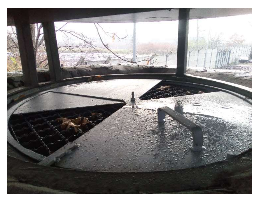
Fig. 2. The opening W(2016) – the regulation window