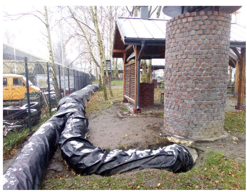
Fig. 7. The air duct installed at the surface for connecting the opening W(2015) with the opening W(2016) - the recuperation